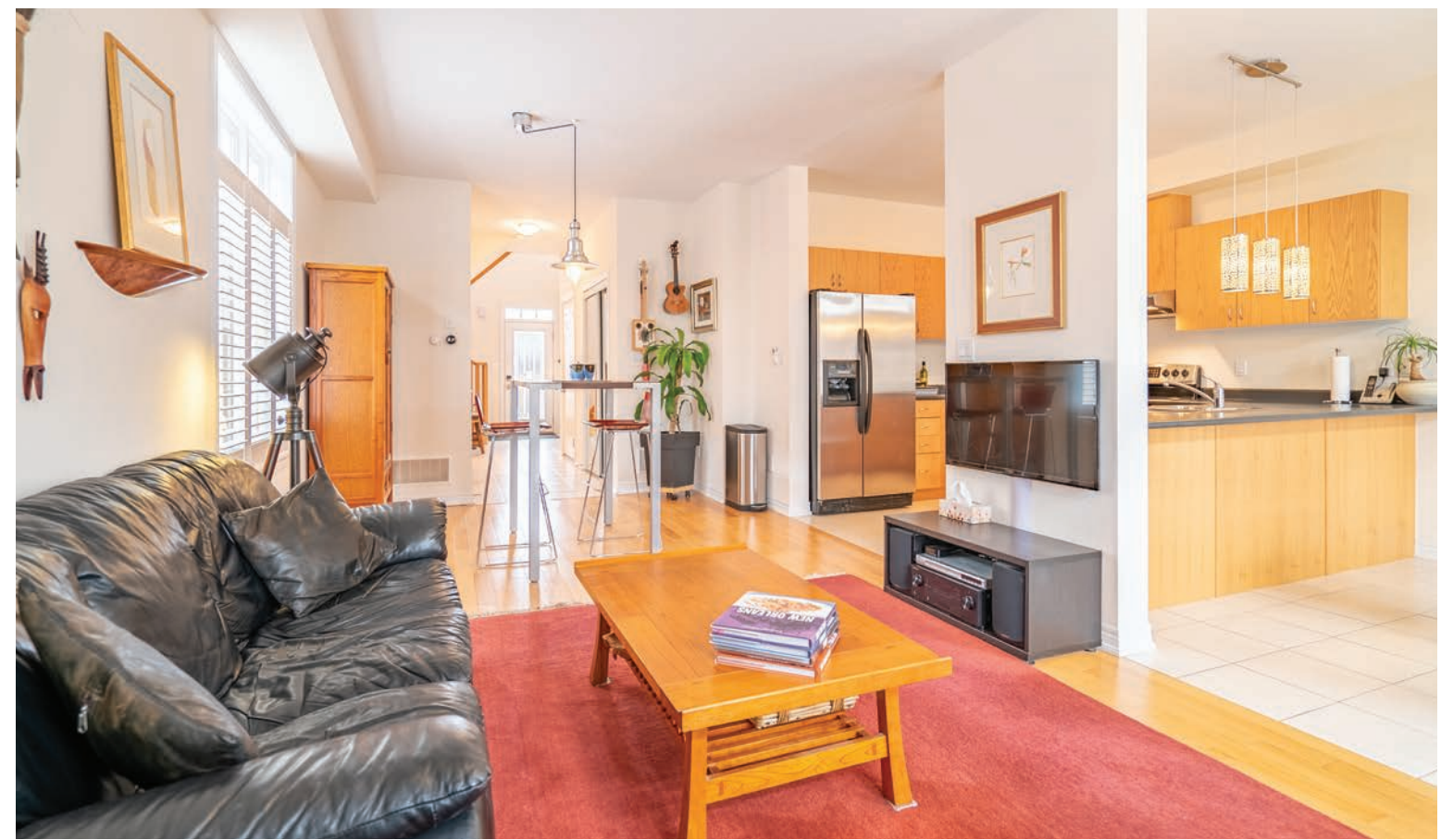
The 1730 sq feet has 3 bedrooms and 2.5 bath, has been well maintained by the original owners. With $30k upgrades including - upgraded master ensuite with walk-in shower, soaker tub and double sinks; oak hardwood floors and staircase, custom California shutters throughout.