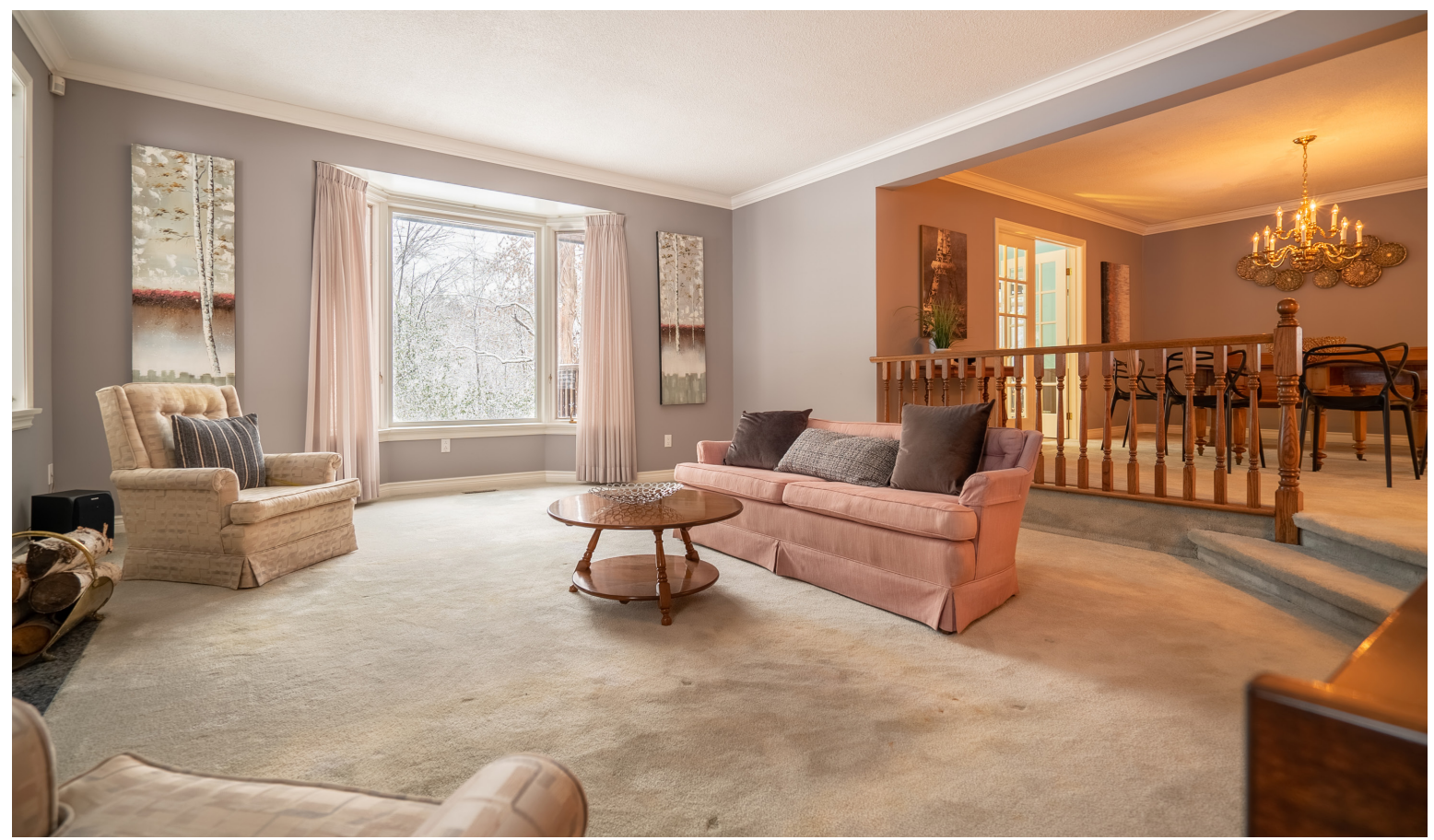
This large, sunken living room features a gorgeous woodburning fireplace that's sure to make you feel at home. The large bay window allows for lots of natural light to flow in.