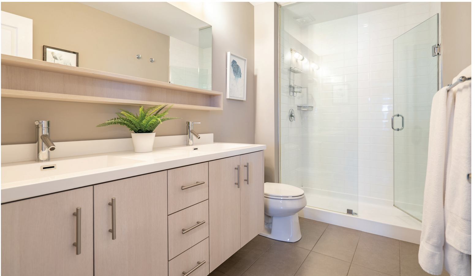
Note the unfinished basement with rough-in bathroom!! Ground floor bedroom/den with full ensuite is also perfect for a home office