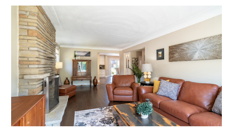
The entrance in to this Burlington home is very welcoming and opens up right into the lovely living space featuring a stunning brick fireplace. The large windows throughout the home allow for tons of natural light to flow throughout.