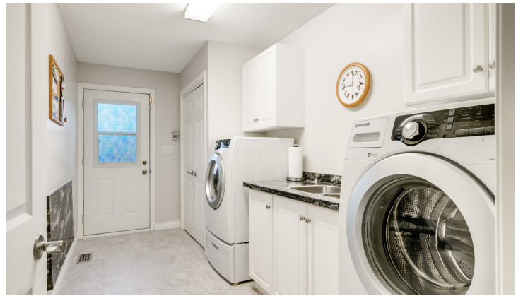
Walking in notice the vaulted ceilings in the great room and the cozy gas fireplace. Enjoy the main floor laundry room with storage, folding table, and walk out to the balcony!