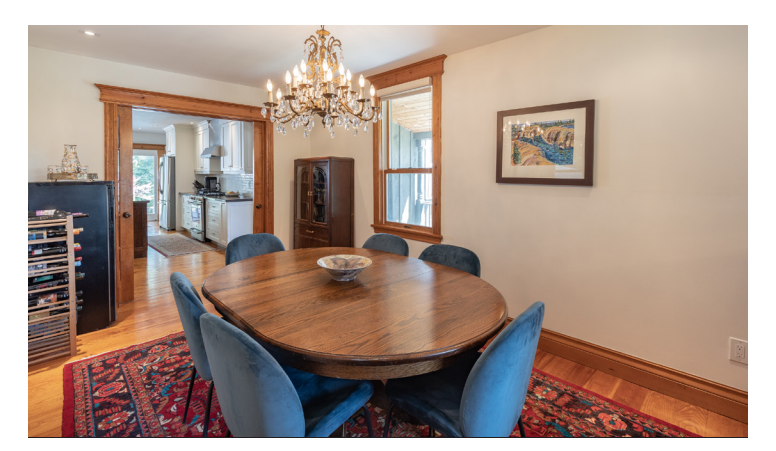
Enjoy this formal living room and dining room with beautiful antique chandelier with sliding pocket doors leading into the chefs kitchen.