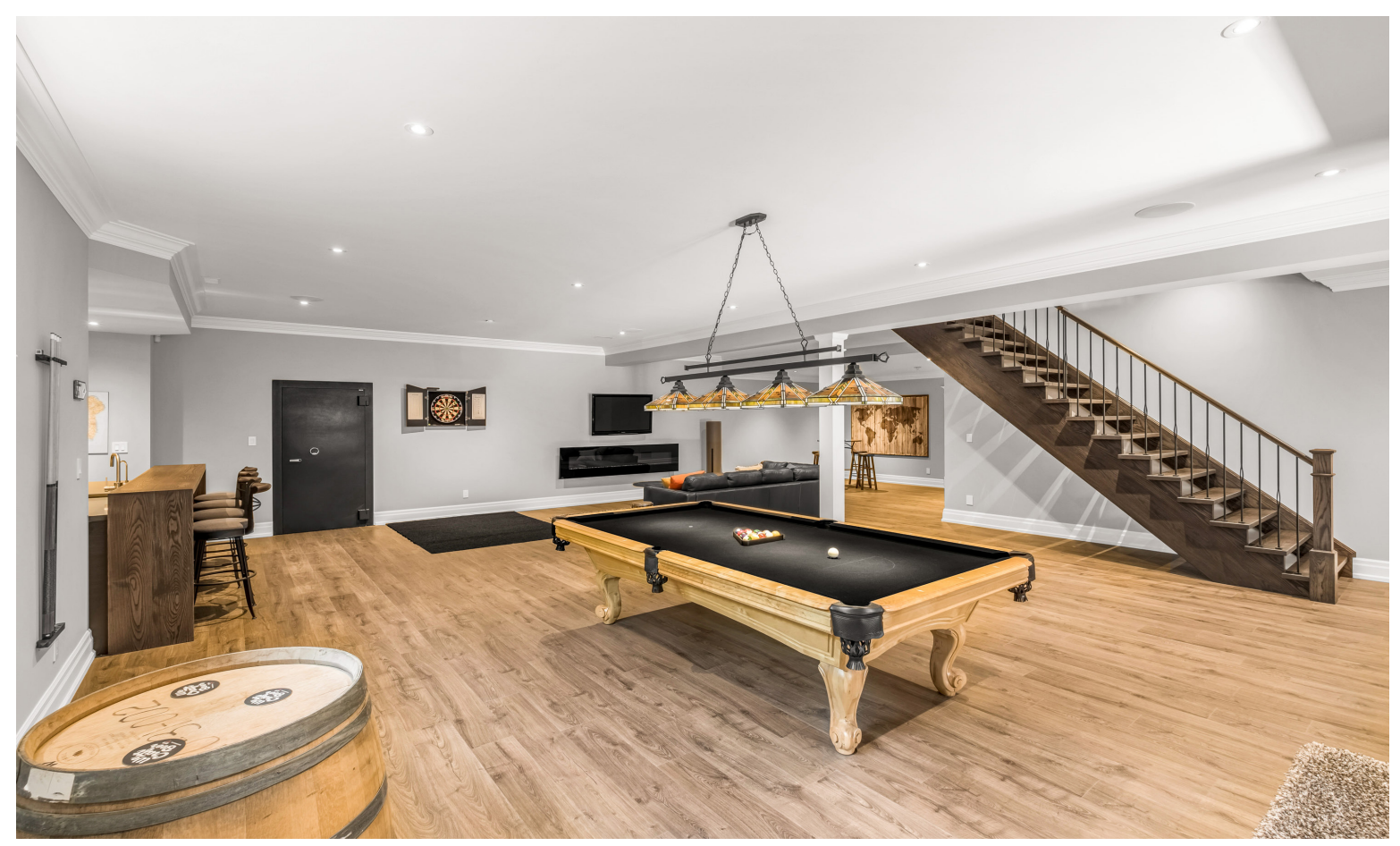
The fully finished basement has it all; in-floor heating throughout, bedroom with ensuite, custom wet bar, temp controlled wine cellar and even a "safe" room.