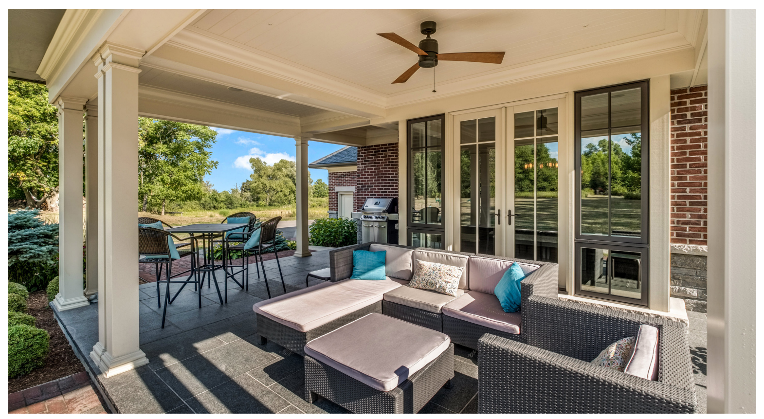
Outback features a lovely covered porch. Enjoy the old "horse trail" and explore the property.