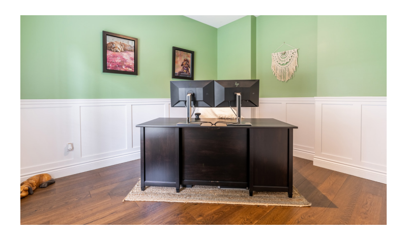
As you walk in to the bright and spacious foyer you will notice the stunning high ceilings and a quiet office space.