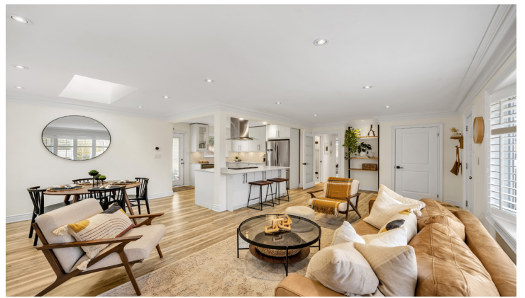
Some of the many features of this home include a cozy open concept living room adjacent to the fabulous breakfast bar!